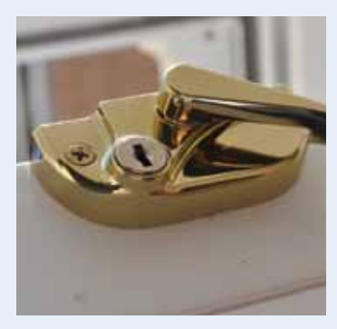
High Security Hardware