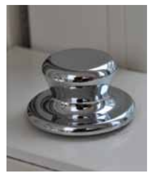
Chrome Slider Also available in white and gold