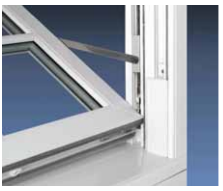
Deep Bottom Rail option

All our dealers are regularly vetted to ensure that they are adhering to the latest survey and installation guidelines, giving you peace of mind that the product and the service will be to the highest standards.