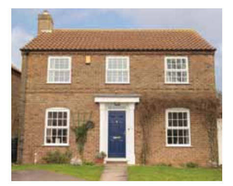
PVC Windows and Doors