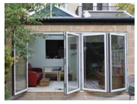
Aluminium Bi-fold Doors

With our 30 years of experience we are confident our products will enhance and add value to your home.