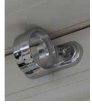
Chrome Ring Pull Also available in white and gold