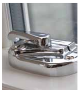
Chrome Latch Also available in white and gold